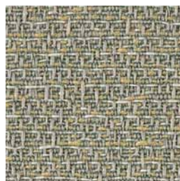
Tiger Eye 030