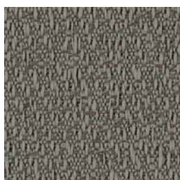
Smoky Quartz 031